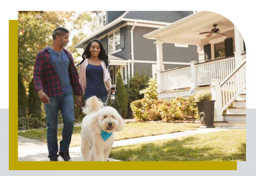
PERSONAL BANKING SOLUTIONS